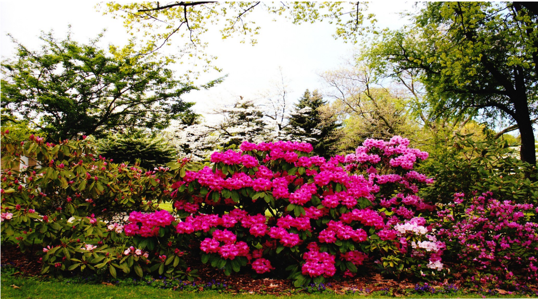
Rhododendron "Blossom's Blaze" Brier Hill Garden