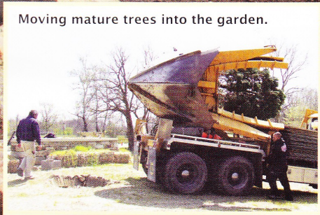
Moving mature trees into the garden.

"Right now the north end of the garden is in a lot of sun," Gettig said, "but as trees grow it will get shadier and we will be able to plant a greater variety."