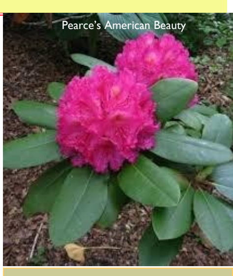
R. 'Pearce's American Beauty' R. 'Florence Park's' Available

(Purchase $4.00 ticket Corning Visitor Center)